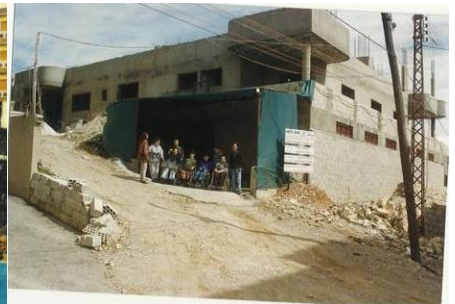
Stages of construction of the "Home of Tenderness" - Anta Akhi year after year